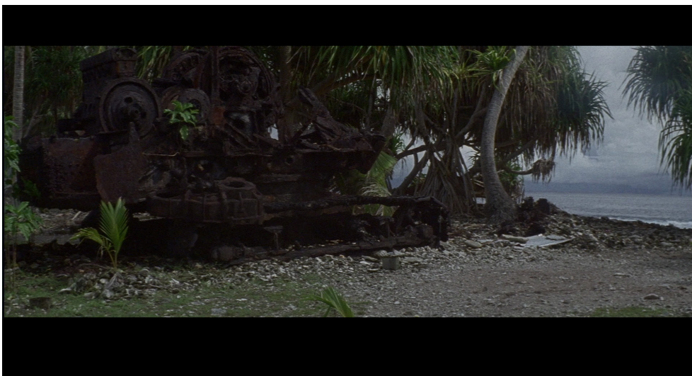
Fig. 7: Ben Rivers, Slow Action .

Mounds of trash or rusted out shells of cars are reminiscent of the aesthetic presence of Arte Povera or the ultimately formalist trash aesthetic of someone like John Chamberlain, but crucially, in Slow Action they appear precisely not with the pretention of art works on display. In addition, Rivers uses the historicity of anachronistic projection techniques to produce geometric bodies that, in accord, with the soundtrack can be perceived to recall sci-fi genres. These cubes will return in Urth , as well, in the botanical interior of Biosphere 2 —strangely and unexpectedly, as factual objets trouvés, which Rivers did not even have to stage, since they actually