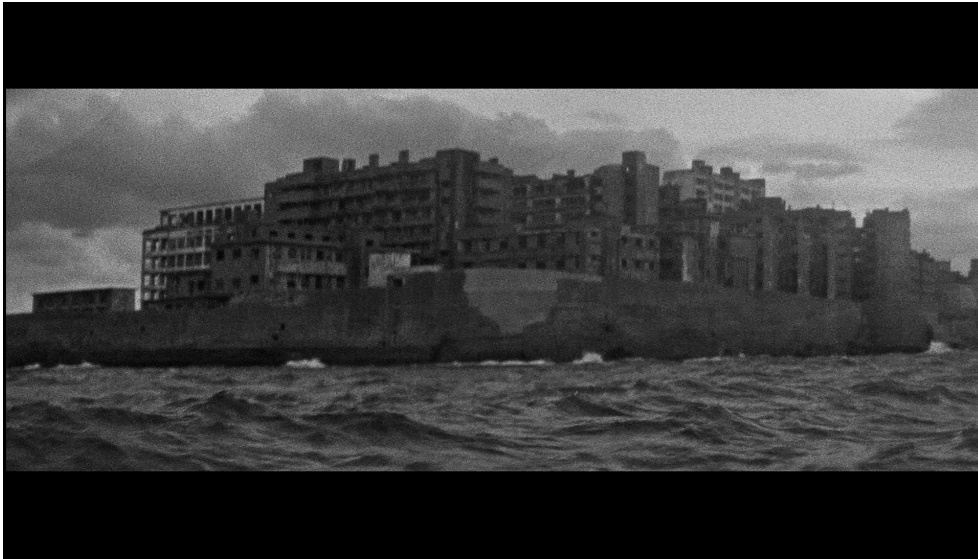
Fig. 6: Ben Rivers, Slow Action .