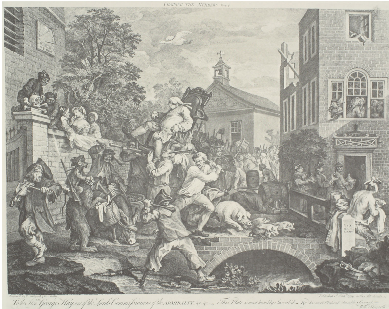
Fig. 2: William Hogarth, Four prints of Election , Plate 4, 1757 or 1758, 403 x 540 cm.

Election 4 (1758) [Fig. 2], it is particularly striking how Goya reduces the surrounding townscape, which still characterizes the representation in Hogarth's prints and paintings, to an apocalyptic landscape emptied of human presence. 13 The only thing that still remains of the life of society is the battle between the two rivals. There are no witnesses to this rivalry within the image. The fight scene thus appears like a reduction of the essence of duelling. Moreover, in order to maintain control over their distance at such close bodily proximity, the duellists look each other directly in the eye. They blot out the nature that surrounds them. The apocalyptic landscape and the quicksand-like abyss that opens up beneath them isn't visible to them , although the coloration of the landscape in particular seems to pervade the forms of the fighters' bodies. The rivals, meanwhile, are focused only on their own combat. Winning this is the only thing that matters. The struggle against the forces of nature, the morass that threatens to swallow them, is something they can only lose. But even more grave is the fact that the two rivals are not even aware of nature. It is therefore, as Serres writes, "more than likely that the earth will swallow up the