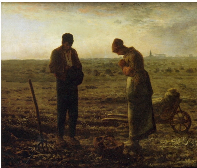
Fig. 3: Jean François Millet, L'Angélus , 1857–1859, oil on canvas, 55,5 x 66 cm, Paris, Musée d'Orsay.

From the art historical perspective, and with a view to an aesthetics of the natural contract, it may seem noteworthy that Serres introduces his reflections with a painting by Francisco de Goya, or later points out that only a false path estranged from the world could lead from the Duelo a garrotazos to a conception of life of the kind that Jean-François Millet still considered worthy of depiction in his painting Angélus (1857-59) [Fig. 3] (CN 37). But nowhere does Serres offer an aesthetic theory, much less an exemplification of art works that would be adequate for his world-inclusive natural contract or would actually correspond to an artistic experience. Given the legal-philosophical perspective that Serres obviously adopts, the view of art at first remains obstructed. But at the point where the thoughts of the natural contract manifest themselves as form and experiential space, if not earlier, the question of an aesthetics of amazement becomes critical.