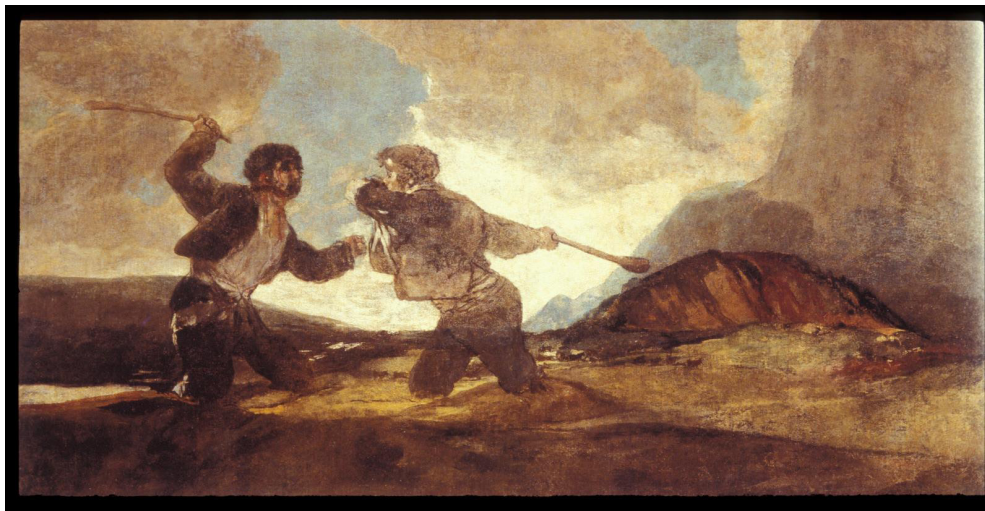
Fig. 1: Francisco Goya, Fight to the Death with Clubs , 1820–1823, mixed media on mural transferred to canvas, 123 x 266 cm, Madrid, Prado.

Michel Serres’ Contrat naturel opens with an allegorical unpacking of Francisco de Goya’s Duelo a garrotazos [Fig. 1]. The picture—part of the “Pinturas negras” cycle, which was painted between 1820 and 1823 on the walls of the Quinta del Sordo and has been in the collection of the Museo del Prado since the 1880s—depicts a duel between two men armed with sticks in the foreground of an anonymous landscape, under a clouded sky. Due to their struggle, the men are sinking ever deeper into the morass. The sky seems to darken, no ground seems to support them.