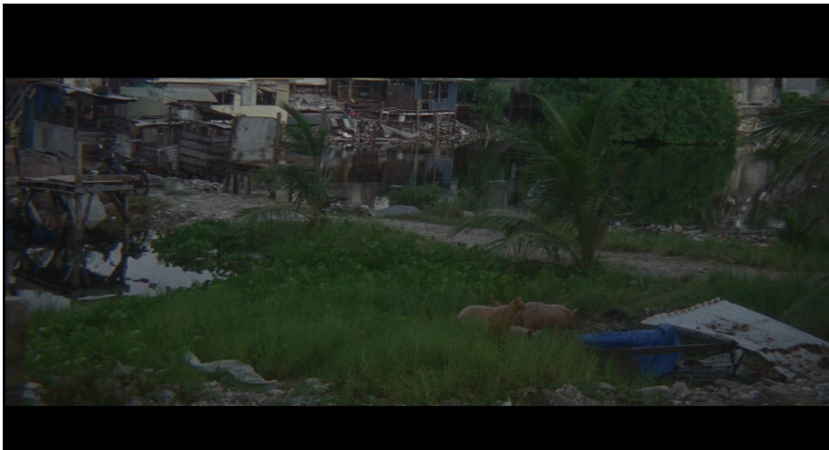
Fig. 8: Ben Rivers, Slow Action .

existed in Biosphere 2 . In the film, they often appear in the same kind of light as in Slow Action —overexposed, with a colored, mostly red or yellowish tinge [Fig. 8]. The cinematic alienation effects of these images stand in an analogous relationship to the contamination of nature, the toxic effect of which is often indifferent to its appearance. In Slow Action , the “idea of an island,” 26 as well as the perception of the deserts or coastlines, is therefore no longer possible in the sense of an “innocent landscape,” 27 but neither does it close itself off from the albeit broken beauty that, astonishingly, persists.