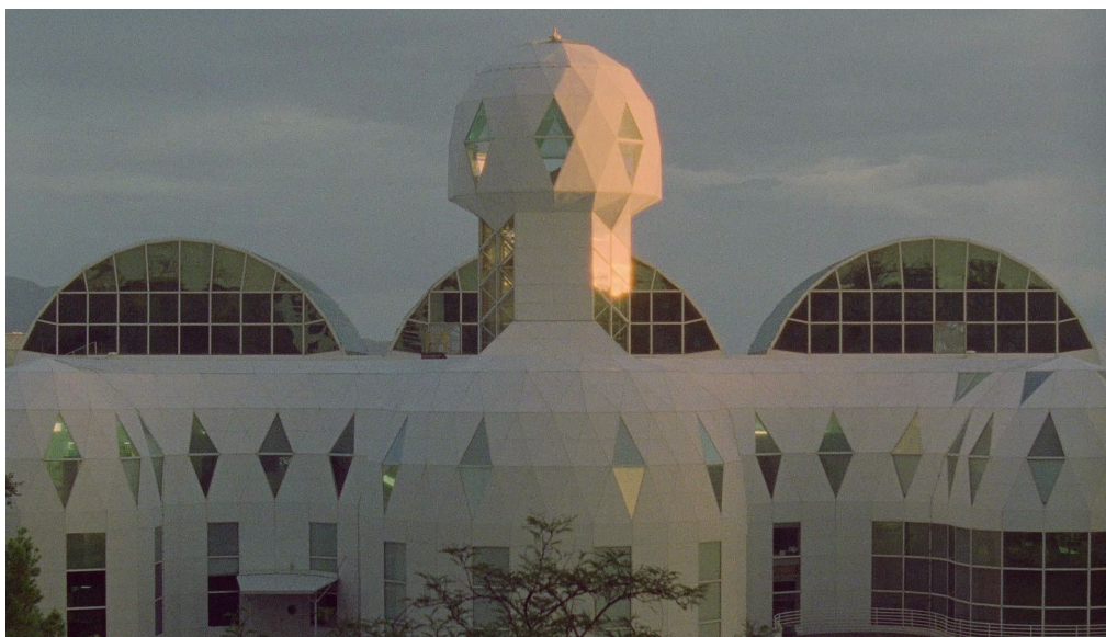
Fig. 4: Still from Ben Rivers, Urth (2016).

In aesthetic terms, Serres' legal-philosophical conception of a new natural contract has a prominent counterpart—not least in its ambitions—in Biosphere 2 , the research project conceived primarily by John P. Allen. Indebted in its architectural language to the geodesic designs of Richard Buckminster Fuller, Biosphere 2 was initiated in 1991 in Oracle, Arizona and for a short time tested the stability of an ecosystem independent of the Earth's biosphere. [Fig. 4]. The potential of Biosphere 2 at the start of the 1990s, however, turned out to be a source of amazement not so much for the scientific community but rather for the media public, and in particular for viewers in front of their television sets. The life of the eight inhabitants came into people's living rooms much like, a few years later, the "human zoo" would do on the TV show Big Brother , created by John de Mol and significantly influenced by Biosphere 2 —namely, as Reality TV. The reality of a second biosphere was consequently simulated, but this simulation was itself real. The ground on which a utopia such as Biosphere 2 could arise, beyond the conventional research projects of established US universities, had been prepared early on in particular by new conceptions of the world, such as Alexis Carrel's L'Homme, cet inconnu of 1955, as well as by science fiction and new age literature.